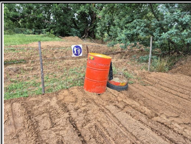
Refuse bin and drip tray on site