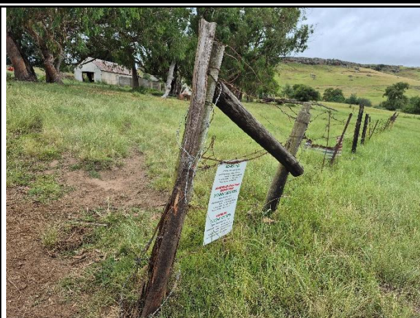
Notice of mining area