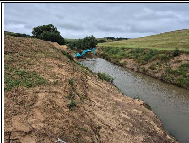
Mining in progress